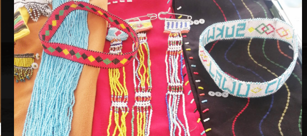
Ncedolwethu Cooperative - Page 27