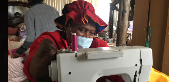
OoMama Zintsika Sewing Cooperative - Page 19