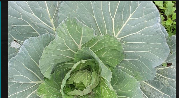
Amajabangqa Agricultural Primary Cooperative - Page 29